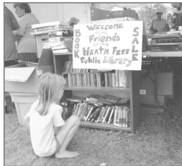
Friends of the Heath Library Book Tent

Like exhibit hall entries, container garden entries must remain on the fair-grounds throughout the fair and must be picked up after 4 PM on Sunday. The Heath Fair is not responsible for lost or stolen items.